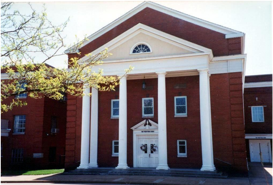
First Presbyterian Church of South Charleston

Speak to each other with Psalms And hymns and spiritual songs, singing and making melody to the Lord with all your heart Ephesians 5:19