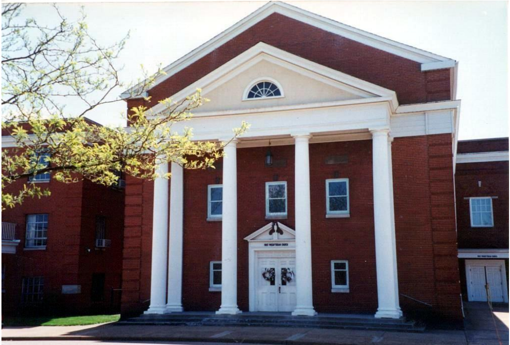
First Presbyterian Church of South Charleston